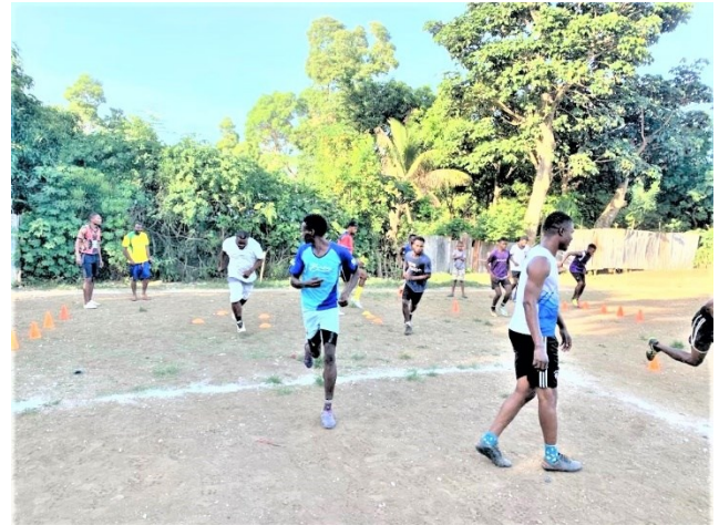
Team in Training

There are few opportunities in Haiti including Fond Doux to come together as a community, relax and have fun. Life is hard and recreational activities are few. One exception is the ability to play soccer or to come together to cheer the local team as they play in a community league against rivals from nearby towns. In January of 2021, the Foundation completed the expansion of the community soccer field in Fond Doux to make it regulation size. It was not the most popular project of the Foundation in the US. But it is a hit in Fond Doux. We still have a deficit of $3400 USD because we use only designated contributions to pay for the soccer field. This year special donations raised