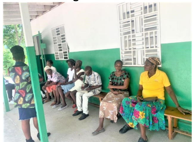
June 30 th Meeting Of Midwives