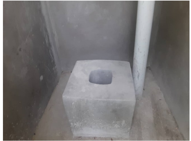
One of the Stalls of the Latrine

The Foundation subsidizes the school (pays the salaries of five teachers) and paid for the materials for the construction of this facility. It is difficult to measure the importance of such small things as a decent if not elegant latrine! We rejoice in some small things that improve the lives of our friends and partners in Platon, Haiti.