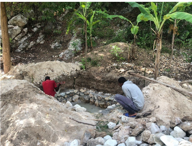
Construction Began in 2019

Construction of a latrine to serve the village and the school in Platon began in 2019. It was done primarily with volunteer labor and proceeded slowly – very slowly. This year a roof was finally put on the new facility. It may not seem like much, but it is a genuine improvement for the people of the village of Platon and for the students and teachers at the Good Samaritan School in Platon.