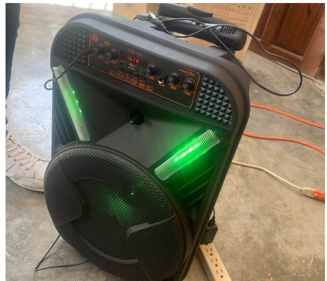
Radio for English Club

Because, Haitian children are often hungry and malnourished, the board decided to occasionally provide a Vita Mamba snack, a specially designed Haitian children's nutrition supplement, for the young people in the class. They also purchased a radio, useful for learning English through English songs. This was a request of both the teachers and the Executive Director.