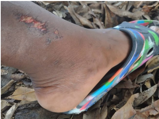
Wound from Accident