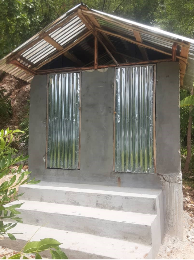
New Latrine at Platon (June 2022)

Construction of a latrine to serve the village and the school in Platon began in 2019. It was done primarily with volunteer labor and proceeded slowly – very slowly. This year a roof was finally put on the new facility. It may not seem like much, but it is a genuine improvement for the people of the village of Platon and for the students and teachers at the Good Samaritan School in Platon.