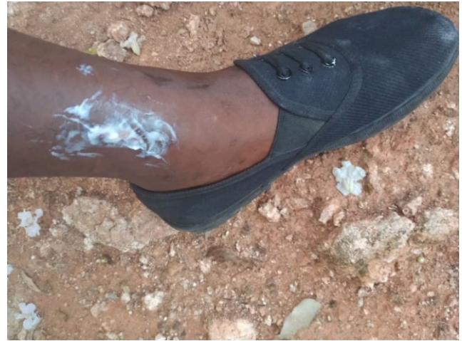
Wound after Treatment

Madam Christela cleaned the wound and placed an anointment to cover the wound. In this case she chose not to bandage it, although she could have. The patient was very pleased.