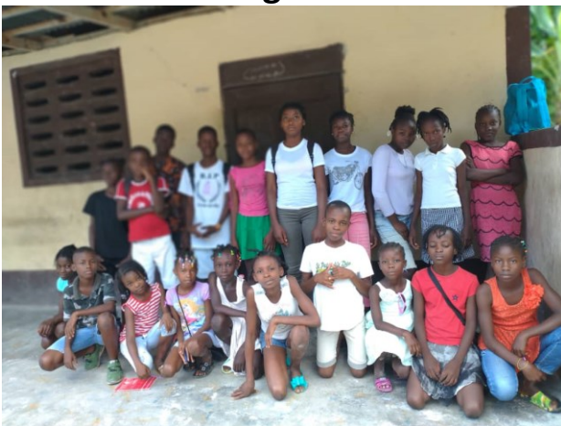
Ravine Parc English Club