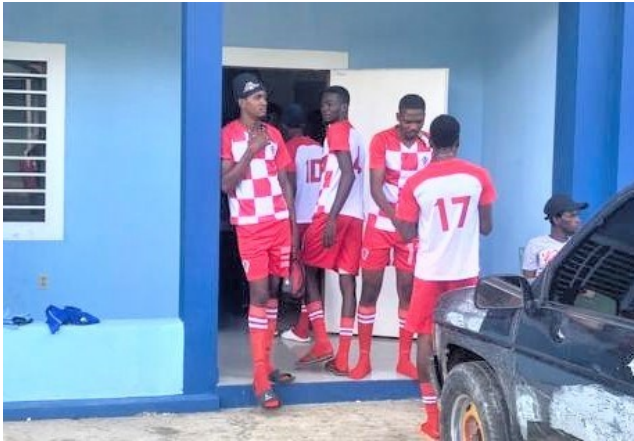
New Uniforms for the Village Team

enough money to buy some new uniforms and shoes for the community soccer team. The whole community takes pride in the team. The first game took place on Sunday June 26 th .