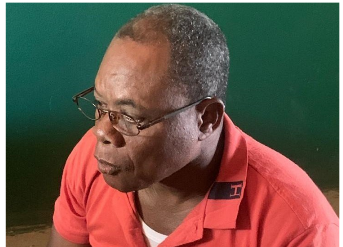
Ready to Read