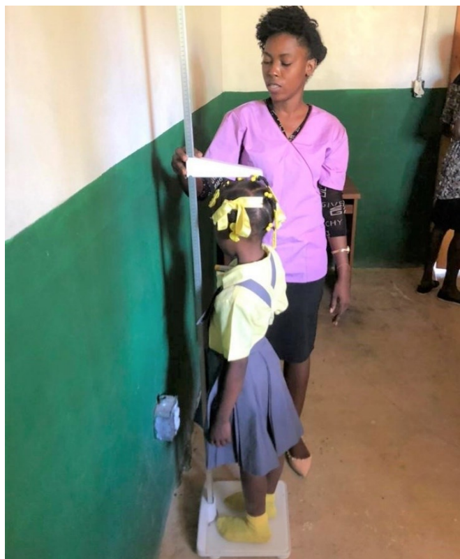
Measuring the Height