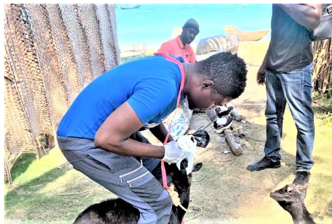
Deworming the Goats