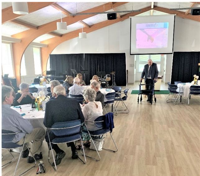
Presentation on Fond Doux Foundation

On January 15 th and February 19 th , the board of the Fond Doux Foundation met to consider the next steps for the Foundation. A very important step is to broaden the base of funding for the Foundation. At the present time we are far too dependent upon a small (tiny) group of key supporters. The loss or death of anyone of them could cause severe financial difficulties for our work. Establishing a secure broader base of financial support is essential. The Foundation is hoping to find groups, churches and organizations that will commit to continuing support as well as individuals.