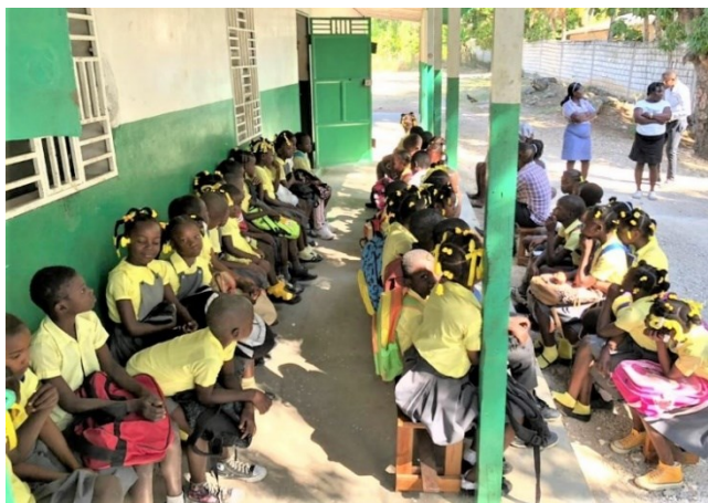
Children from the Methodist School