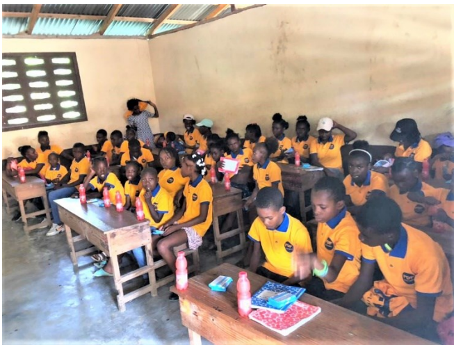
Club Members in Class