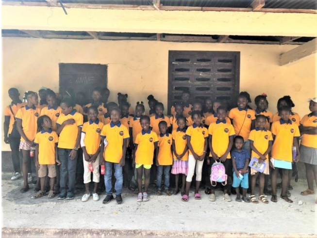
In Front of the Ravine Parc School

The Ravine Parc English Club has grown to nearly 50 students including both Elementary and High School Students. They have various levels of English proficiency. On July 15 th each of the club members received a T-shirt to show that they are members of the Club.