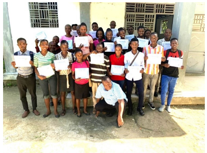
Graduates of 2023 Teacher Training