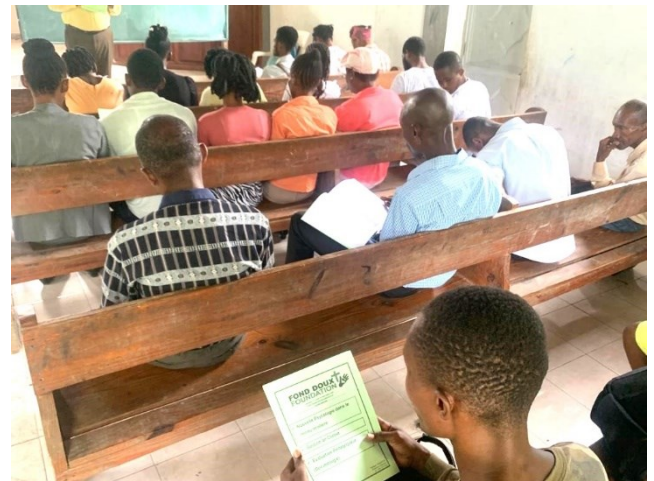
Teachers as Students on Day One