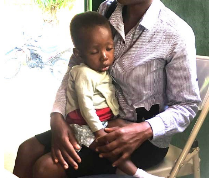
Malnourished Child at Fond Doux Clinic

Recently a child was brought to the Fond Doux Clinic with severe malnutrition caused by his parents' inability to afford food for their children. The great tragedy is that the parents came to Fond Doux to seek a better life. They were told by a trusted friend that there was a job for them in Fond Doux. When they arrived, however, they were told that the job had already been filled, but that they had another job for the parents in a school. Unfortunately, the different job also turned out to be ill-fated. School jobs in Haiti have small pay and schools are notorious for not paying their employees all of their promised pay. This turned out to be true again. Meanwhile, the child became severely malnourished. A Genuine tragedy!