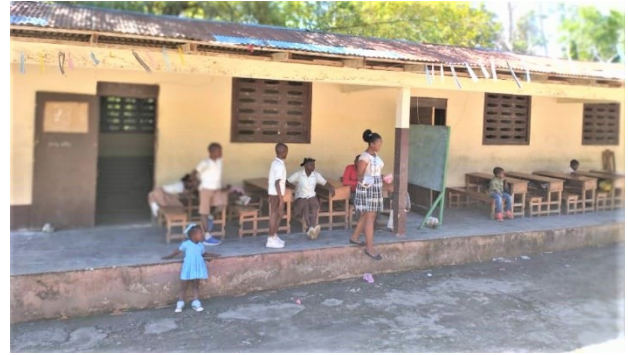
Hope for Tomorrow School, Ravine Parc

Although we have received many urgent requests to help the Ravine Parc School (literally begging us) to prevent its closure, we have not included the basic minimum of $6,000 in our annual budget because we already need additional resources to meet our present commitments! Several times the Foundation has given the school an emergency grant from a gift designated by a donor for the school. However, to begin subsidizing this school requires raising an additional $6,000 to $12,000 annually that we have no idea from where it might come. Although we are acquainted well with people (Our English Club is hosted by the school), we simply could not make a commitment, only issue a plea. The school has grades K thru 6 th and fortunately a substantial building. How long the school can survive with teachers that are virtually without pay is unknown. It is on our prayer list. Please add it to yours.