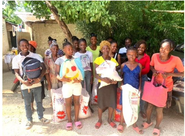
Food at Ravine Parc Nov. 25 th , 2023

do so. We therefore cannot provide it for the whole school. Perhaps in the future we will be able.