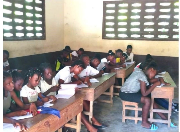
Part of Ravine Parc English Club