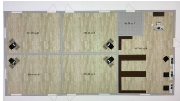
Possible Floor Plan

about $100,000? Or $40,000? Yes, you can have that kind of an impact! You can do it with a $10,000, $5,000, or $2,000 gift. Yes, that is digging really deep, but look at the difference it makes -- a brand-new school, four classrooms and a library! In the USA that is several million dollars. You can act like a billionaire. We need just $60,000 more. Pray with us. We need a few more people to have their hearts deeply touched and it will be a reality. What a difference it will be! Can we get it done this year? It is our prayer!