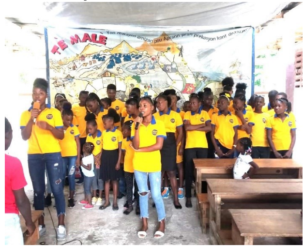
Ravine Parc Program

Afterwards the teachers said: "First of all, we greet each of the members of your mission for Haiti, more precisely, the board of the Fond Doux Foundation. We don't have any words to explain and show you how happy we are for the time that we had together. We thank you for the support that you give us. We pray that Jesus Christ will keep blessing you during your life. A good thanks also to each of those that agreed to give something to enable us to realize this activity (the donors)."