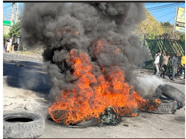
Demonstration in Carrefour, Port-au-Prince

In last month's Fond Doux Flyer, we incorrectly reported that Vita Mamba had replaced other snacks at the Ravine Parc English Club. The report was pre-mature as we had anticipated the arrival of the shipment of Vita Mamba. In fact, the Vita Mamba pick-up did not actually take place. It is manufactured in Northern Haiti and transported to a warehouse in Port-au-Prince, but gangs control a portion of the road between Port-au-Prince and Fond Doux (Carrefour). We made 6 attempts to pick up the precious cargo, but each was aborted because of an active blockade of traffic except for one attempt aborted by the need for vehicle repair. We will arrange the pick-up when it becomes possible. We have 80 boxes already paid for.