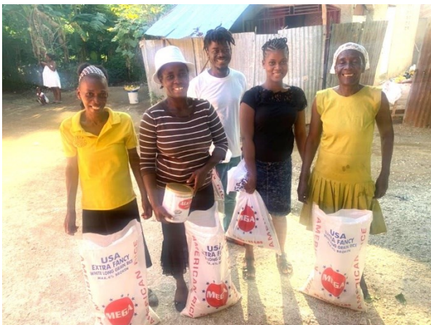
The FDF distributes Food to the Hungry

However, with access to food difficult, many people become hungry. The Executive Director asked the FDF to intervene. He asked the board to provide another emergency food distribution to the neediest and most vulnerable of Fond Doux. So, the board authorized a February distribution.