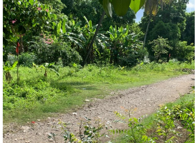
Land across from Methodist Church

Since 2022, the Methodist Church of Fond Doux has been the principal partner of the Fond Doux Foundation. Community events sponsored by the Foundation have been held at the Methodist Church including this past year's Christmas meal. The Foundation needs a building to host community events and the church has a great need for a building to house at least part of its school. We will attack both needs together.