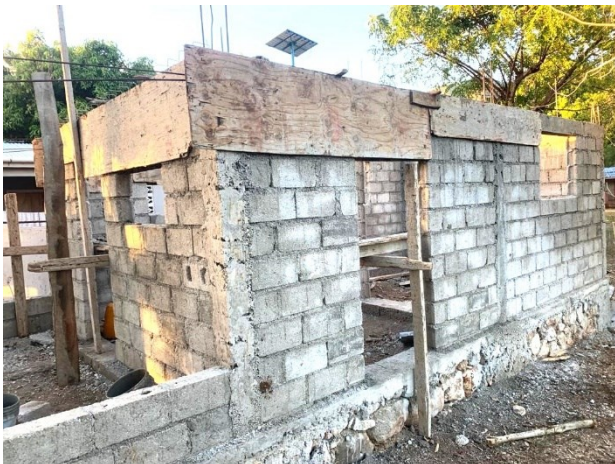
The House Progresses

The materials for the house were provided by the Foundation in exchange for labor on some future construction projects. We believe this is a win/win solution for both him and the Foundation, reducing the cost for both.