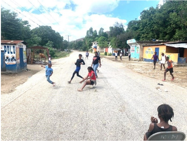
Kids Play on the Highway

On February 9 th , our Executive Director said this to the board: “The wind of panic, the wind of fear and the wind of despair, unfortunately, has been blowing across the entire Haitian territory for the last two weeks. Believe it or not but people are suffering from the lockdown which has paralyzed daily activities!”