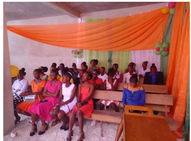
Part of the One Year Anniversary Celebration