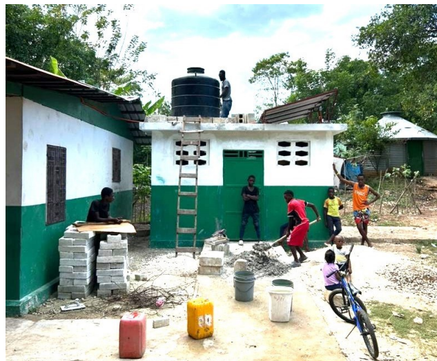
Water Tank Goes on the Roof

During the past year (2024) the Foundation has spent money and energy in upgrading the clinic facilities. We have screened openings and windows, remodeled a room into become a functioning laboratory, erected a restroom for patients and staff, installed solar electric power and most recently installed a water system for the laboratory and rest room. The water for the moment must be trucked in by the truck load because we do not have the money yet for the two more expensive alternatives. This water is quite inexpensive.