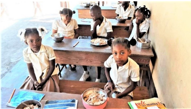
Food at Ravine Parc School

To initiate this program will necessitate an increase in our budget for the Platon School of approximately $150 a month. We are looking for a donor, a group, or several individuals who are willing to provide this subsidy on a continuing basis. When we have met this goal, we will initiate an expanded food program.