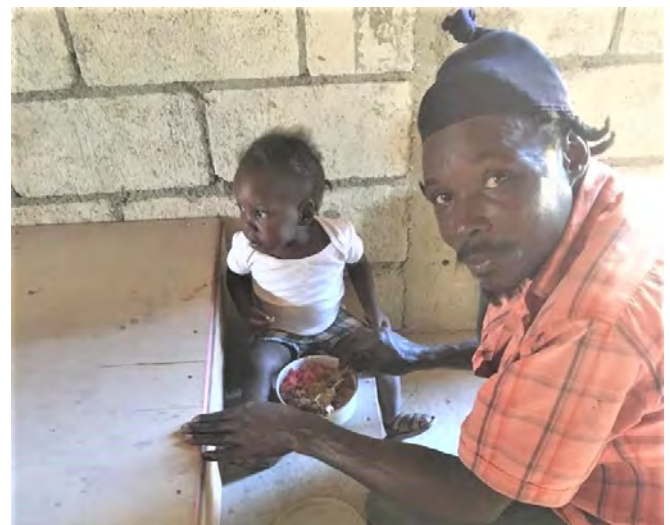
A Father and his Child Enjoy the Meal

The Haitians prepared for 500 people. Although they believe there were actually over 500 people present (an exact count was not made), they had enough food. Many of those that came were children. The people needed to come in shifts in order to serve them all. The preparation of the food was a community undertaking, beginning already the night before.