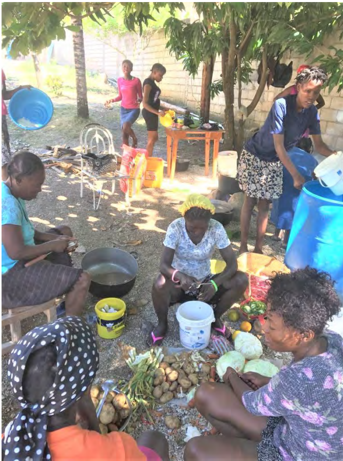
Haitian Food Preparation