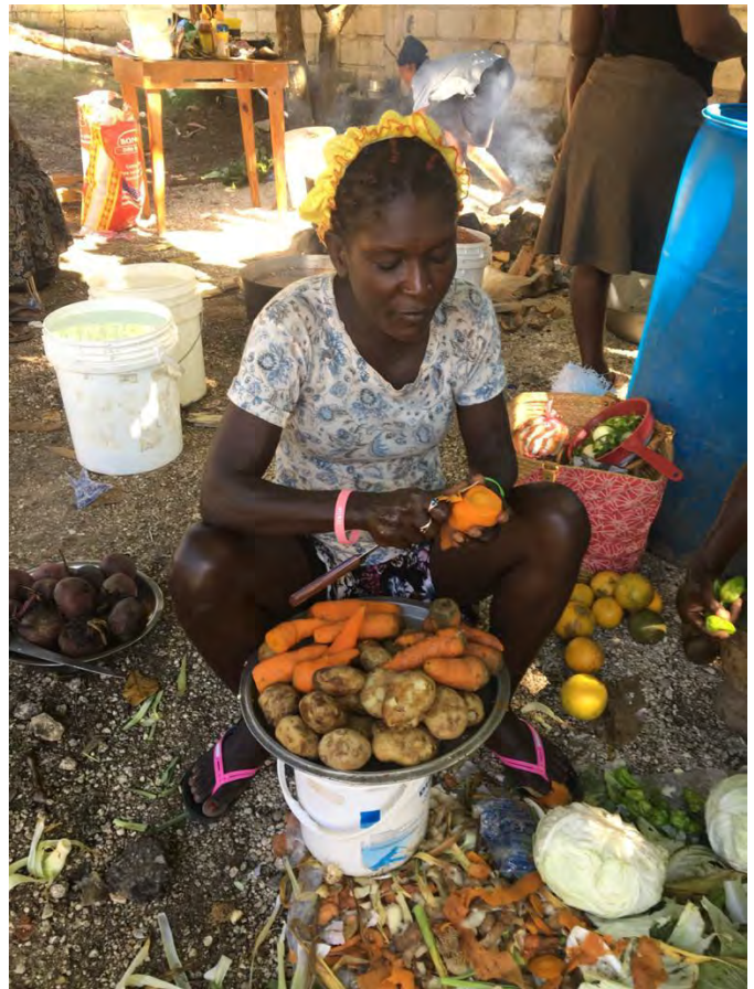
Haitian Food Preparation