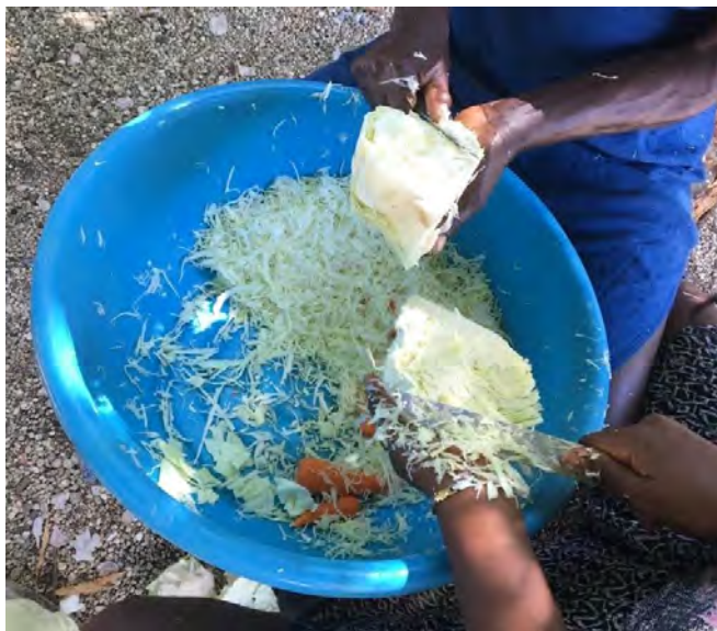
Haitian 'Picklese' Preparation