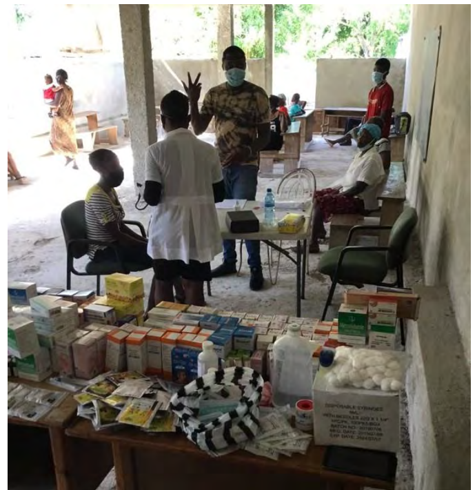
Clinic in Operation

If you take a careful look at the picture of the clinic team above you may be able to tell that they are all wearing a protective plastic shield as well as a facemask.