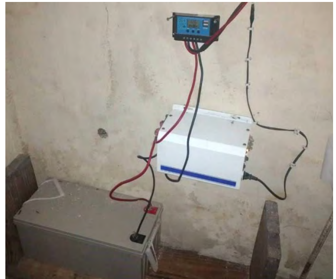
From top: Controller, Inverter, Battery

The Foundation has invested four years into his medical education. How could this education end? No, it cannot! The Foundation purchased a solar system consisting of solar panels, batteries, charge controller and inverter. The panel and batteries produce 350 Watts of electricity, The Inverter could handle up to 1000 Watts. Several batteries could be hooked up to the inverter. Total cost of the solar power system was around $850.