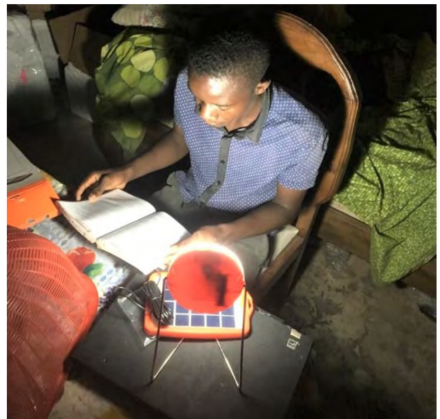
Haitian Student Studies at Night

Are you looking for a very modest investment in the Haitian future? For just $100, you can provide three students the ability to study after dark by providing them with a low cost, long lasting solar lamp. There are probably 100 to 150 homes in Fond Doux with students that could benefit from a solar lamp. What a blessing for so little cost! How do you study without electricity? A solar lamp!