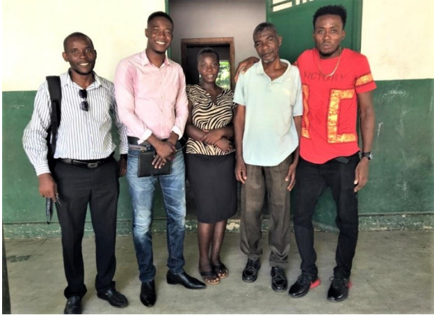
The Clinic Committee